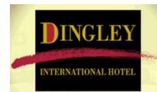
Dingley International Hotel