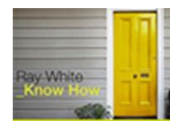
Ray White Dingley Village