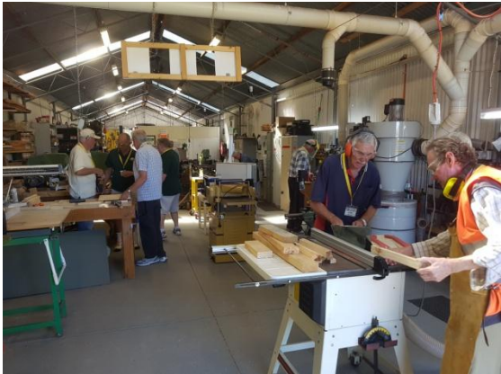
It's great to see so many members getting involved in projects and using the equipment.