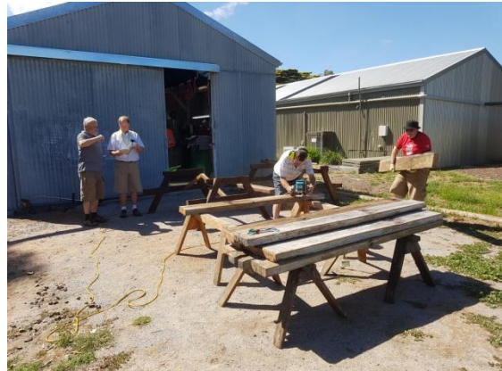
The damaged picnic settings are getting replacement timbers fitted.