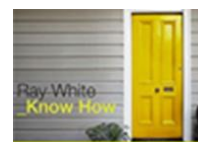
Ray White Dingley Village