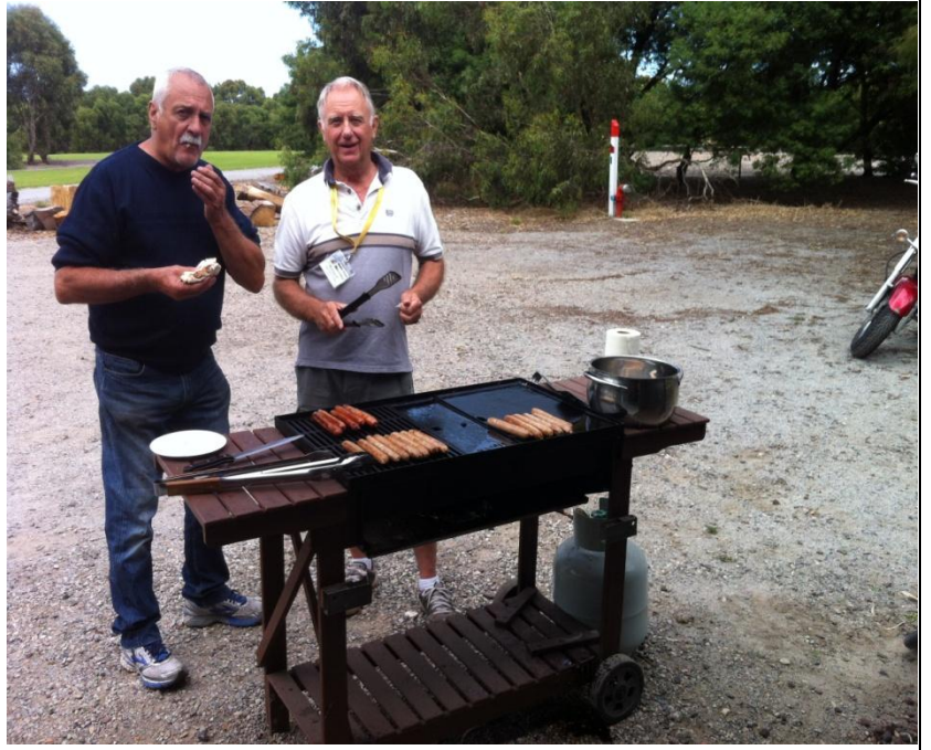
Our official food tester - luckily the cook (chief) has a food handlers certificate and an ambulance was not required.