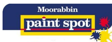
Morgan's Paint Spot