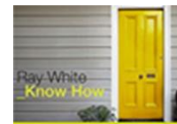
Ray White Dingley Village