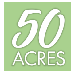
50 Acres Bar & Bistro