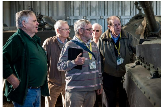
The inspection committee.