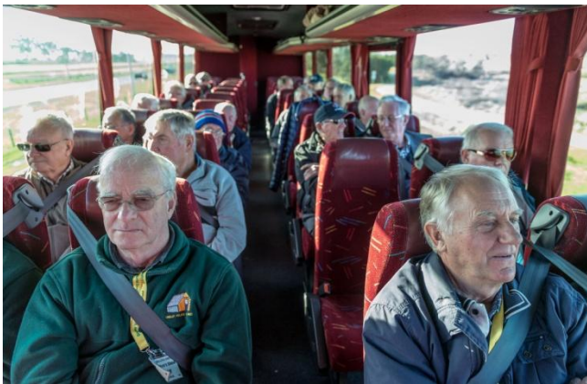
Everyone still awake! Let's have a sing song.