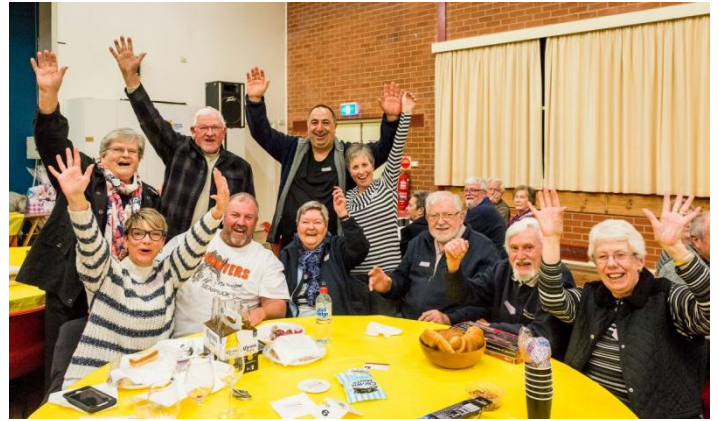
Winners are grinners.