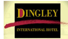
Dingley International Hotel