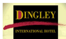
Dingley International Hotel