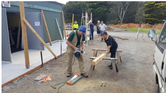
The veranda posts are going into place - more details to follow in the next issue.

An attractive blonde from Cork, Ireland arrived at the casino. She seemed a little intoxicated and bet twenty-thousand Euros on a single roll of the dice.