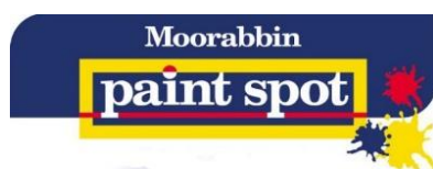
Morgan's Paint Spot