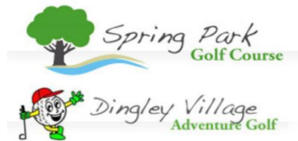
Spring Park Golf Course