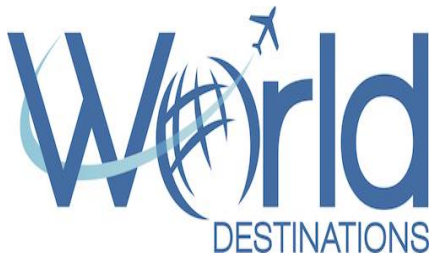
World Destinations Travel Agent, Dingley Village