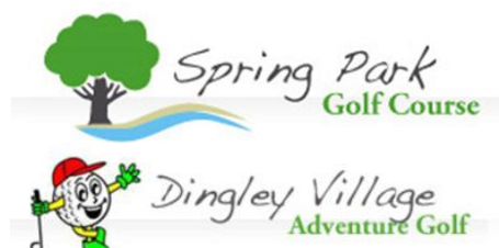
Spring Park Golf Course