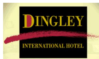
Dingley International Hotel