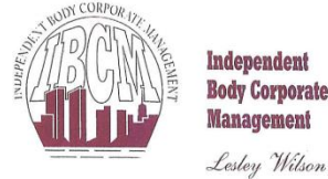
Independent Body Corporate Management