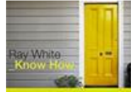
Ray White Dingley Village