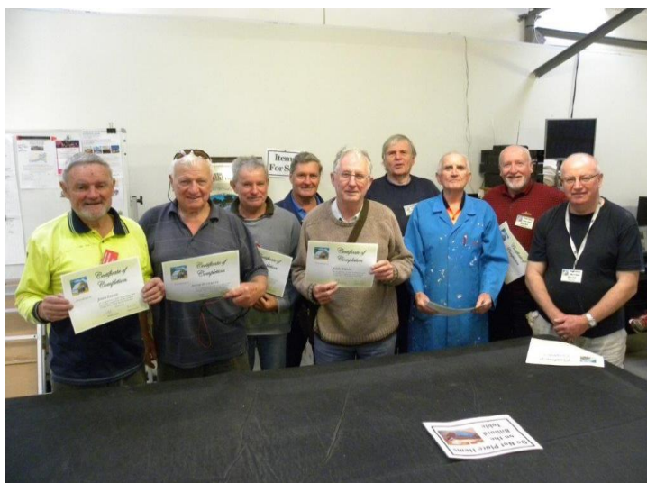
The class of 2015