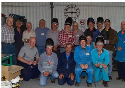
What a team