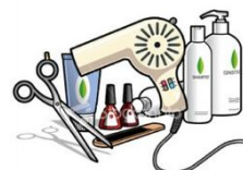
Lise Coiffure Hairworks