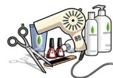
Lise Coiffure Hairworks