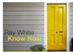
Ray White Dingley Village