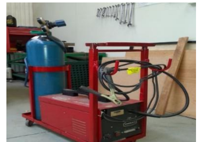
The finished article.