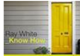
Ray White Dingley Village