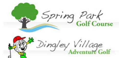
Spring Park Golf Course