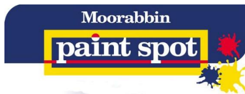
Morgan's Paint Spot