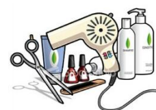
Lise Coiffure Hairworks