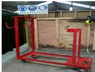
Progress... it actually looks like what it should be !!