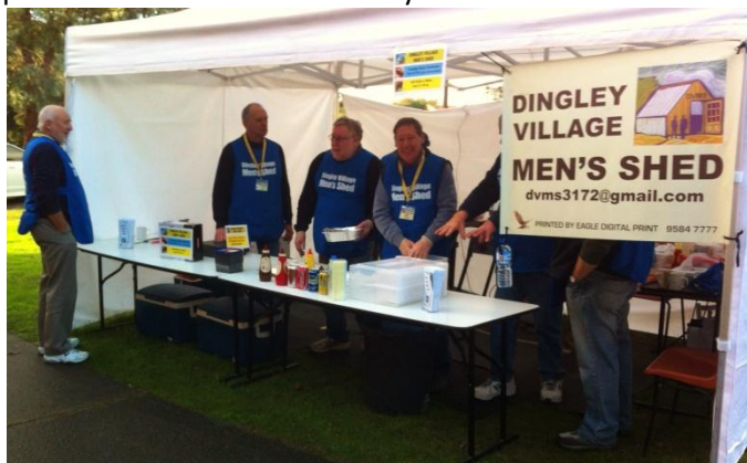
Everything is ready and where are the customers?

The election day is now well behind us but even if your team didn't win, our shed certainly made a success of the sausage sizzle raising well over a thousand dollars that will help boost our building program. Thank you to everyone who helped on the day and especially to the guys that came in early for the set up and those that did the clean up / pull down at the end of the day.