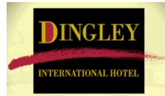
Dingley International Hotel