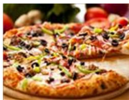
Dingley Pizza & Pasta