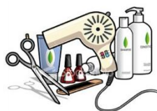
Lise Coiffure Hairworks