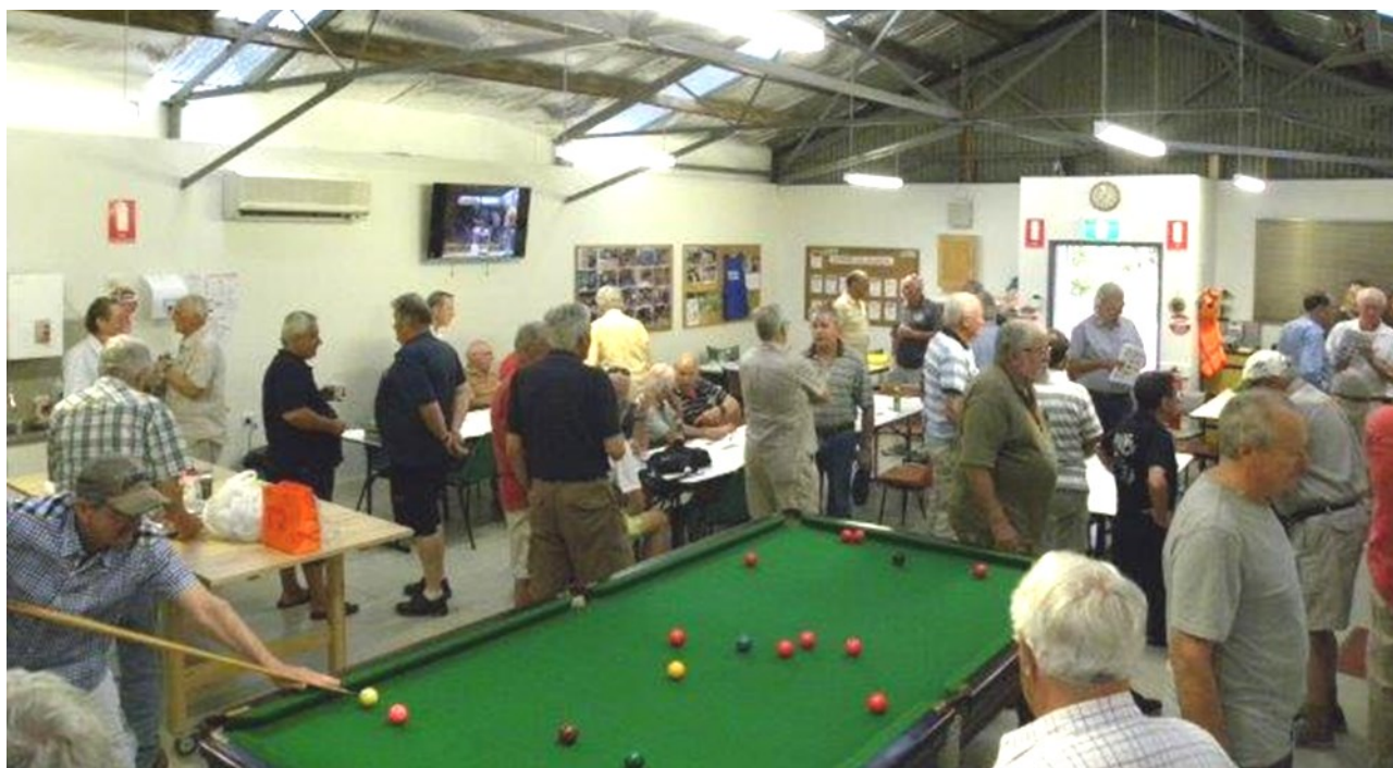
After all our hard work it's time for a game of snooker or billiards.