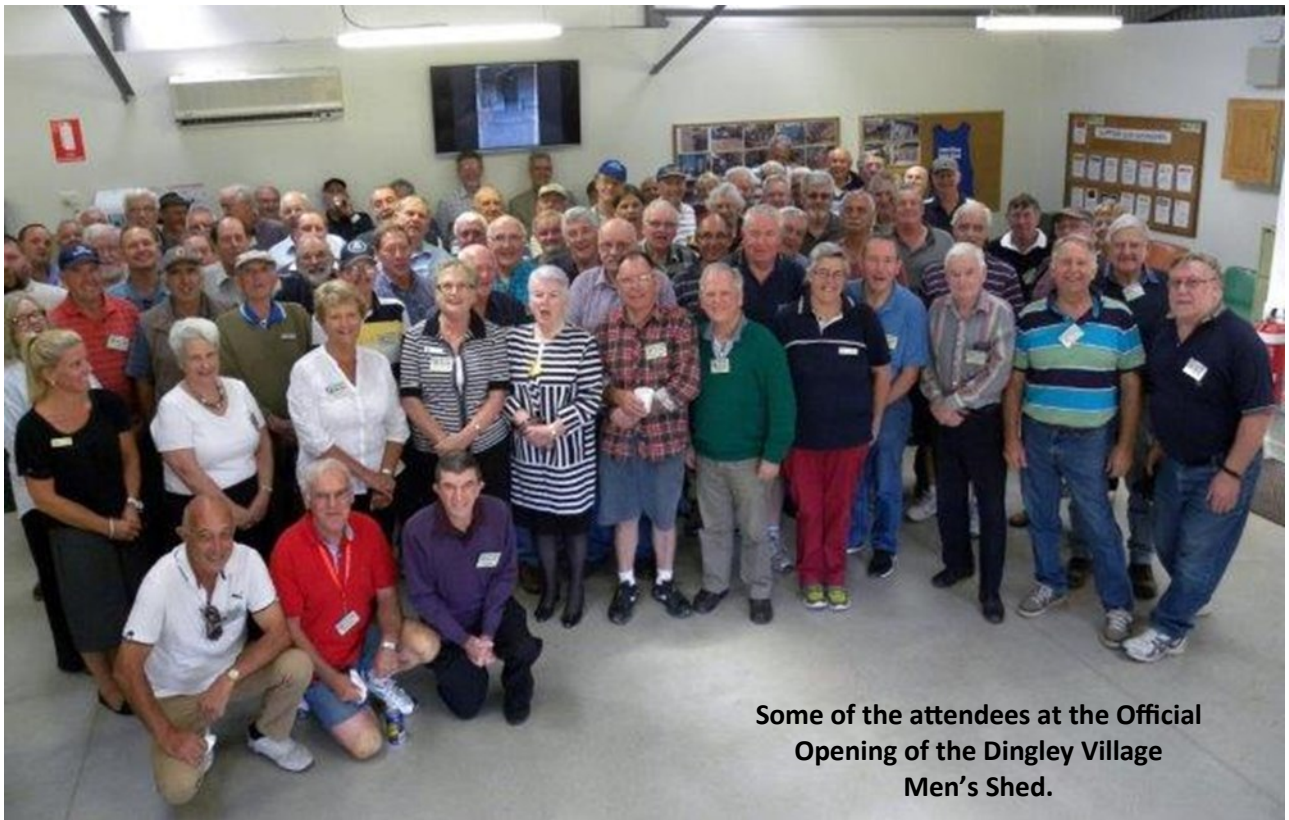
Some of the attendees at the Official Opening of the Dingley Village Men's Shed.