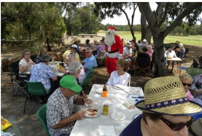
Christmas 'Break-up' Is there a better venue for a picnic? We are indeed very fortunate.