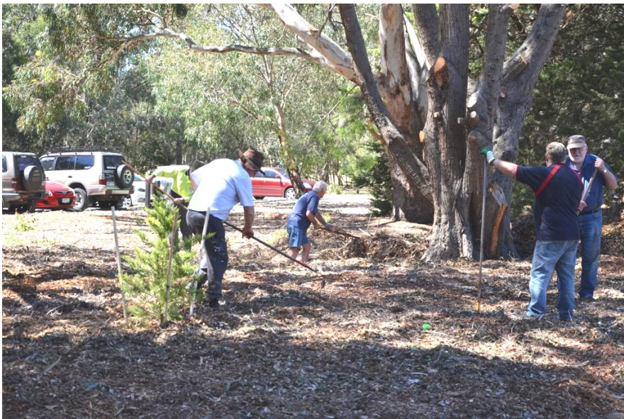
Members helping Parks Vic. spreading mulch in Cypress Drive in the vicinity of our sheds.