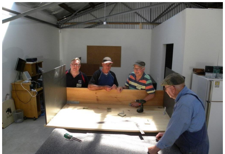
Working on Computer Corner furniture.

'You want two lanes or four on that bridge'.