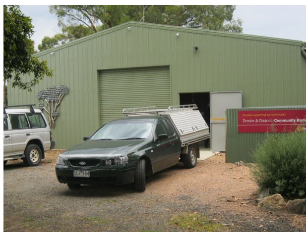
Drouin Men's Shed - the extension will be added to the left of the existing shed.