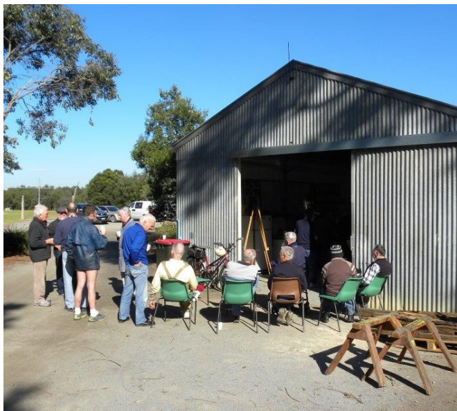
Morning tea at the Big Shed.