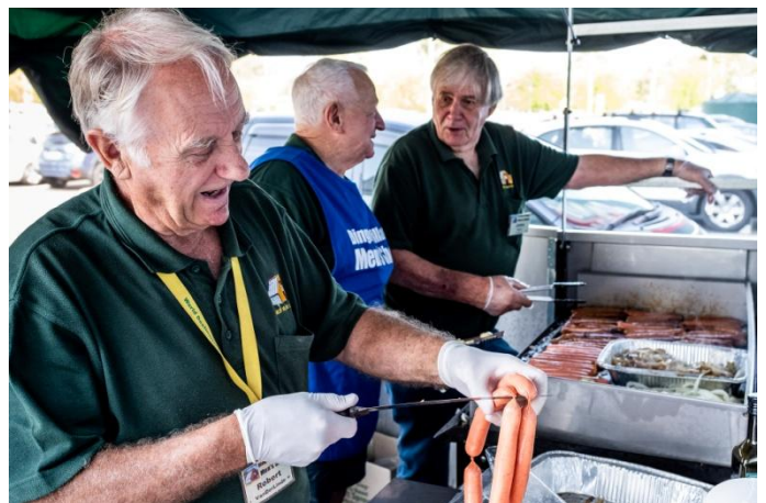
Anyone for a sausage with onion on the bottom?

America is the only country where a significant proportion of the population believes that professional wrestling is real but the moon landing was faked.