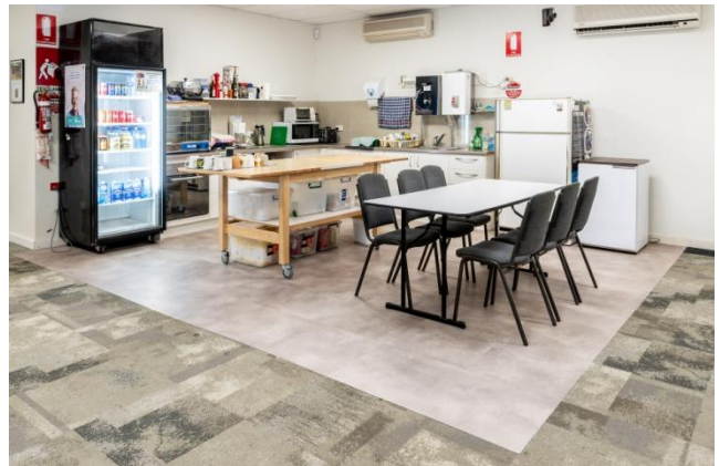
Just how picture perfect is the amenities shed, clean & tidy, now watch what happens at the Friday morning meeting

February - Saturday 16th was a busy day for DVMS as manpower was required for our two main fund raisers - the Dingley Farmers Market and the annual Bunnings BBQ . Thank you goes to Paul for again keeping the team on track at the market and to Robert for all of the work that goes into the BBQ - those kilos of sausages and onion don't just get there on their own. A profit for the BBQ of over $1,100 makes it all worthwhile.