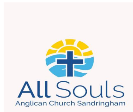
All Souls Opportunity Shop, Sandringham