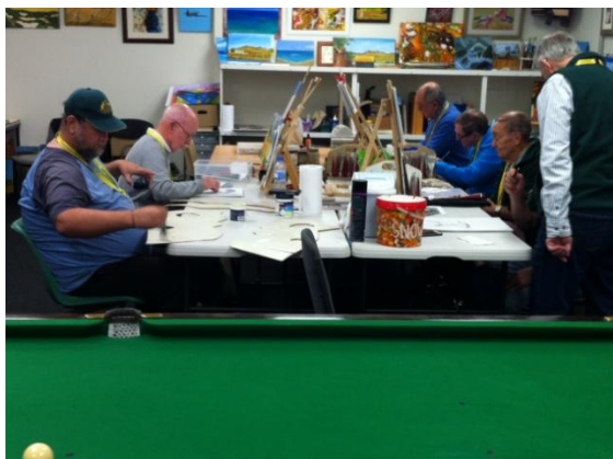
Look at the concentration.

The shed is always busy, the art group are turning out some spectacular work, the billiard table gets a good work over and the kitchen area is always full of gossip and tall stories, some of which are true but always worth telling again.