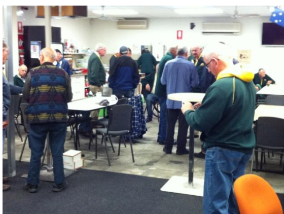
Whoever said that men are quiet and reserved?