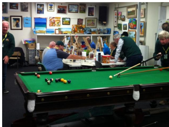
Thankfully it's not a full size table - the margin of error would be greater