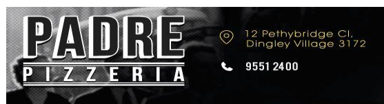
Padre Pizza, Dingley Village