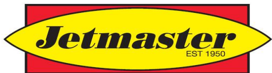
Brilliant Heat. Beautiful to Watch. Jetmaster

The members of the Dingley Village Men's Shed wish to express their appreciation to our wonderful local sponsors and generous donors