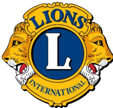
Lions Club, Dingley Village