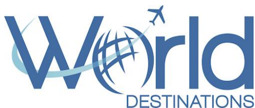
World Destinations Travel Agent, Dingley Village