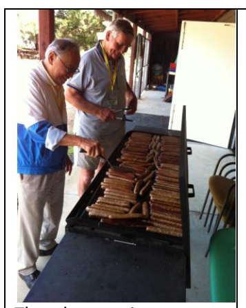
That the catering department have some new cooks.

That the raised garden beds are being constructed but the gardeners are nowhere to be seen.