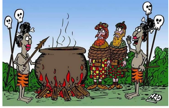
"I couldn't be bothered hunting, so I just grabbed some 'McDonalds'..."