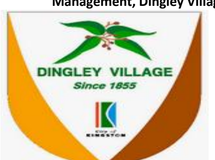
Dingley Village Community Association

Independent Body Corporate Management, Dingley Village