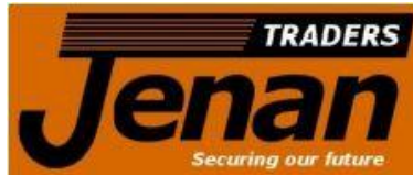
Jenan Traders Pty Ltd, East Bentleigh