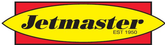
Brilliant Heat. Beautiful to Watch. Jetmaster

The members of the Dingley Village Men's Shed wish to express their appreciation to our wonderful local sponsors and generous donors