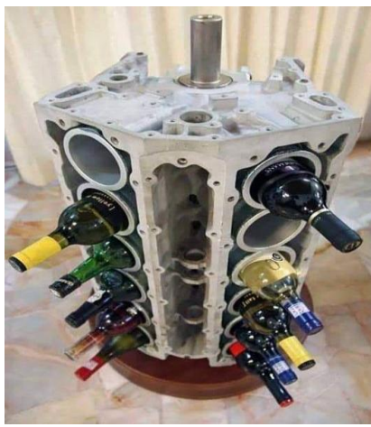
Great idea until you need to move it