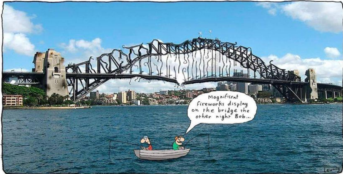
"Magnificent fireworks display on the bridge the other night Bob"