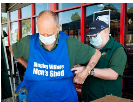
That's funny - they fitted last year.