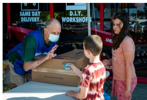
Try as hard as you like - you won't beat me down on the price.