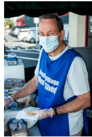
Cooking the onions has always been my job.