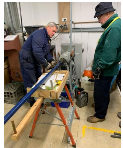
6- The mould at this stage is very hot. The safety guard is removed and the mould and the plastic inside is removed for cooling.