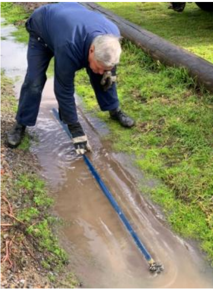
7. There is no cooling trough currently and one is improvised.

( Not very scientific but sometimes the simplest method does the job just fine.)