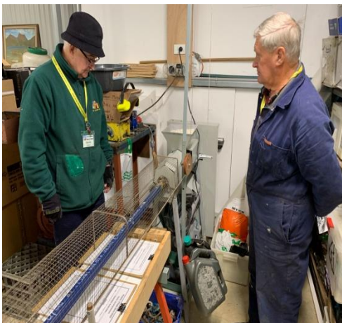
4- The molten plastic is forced by a worm gear into the garden stake mould. Resistance is applied by a rod and counterweights.