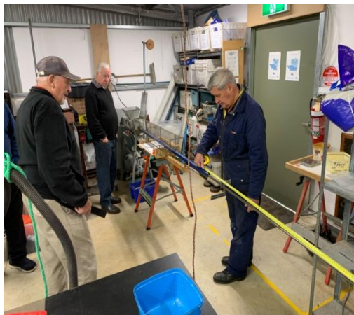
5- The rod is measured to determine the length of the stake as it emerges from the mould.