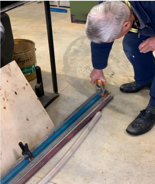
10- As the new stake is flexible at this stage it is clamped to a section of steel angle until cold.