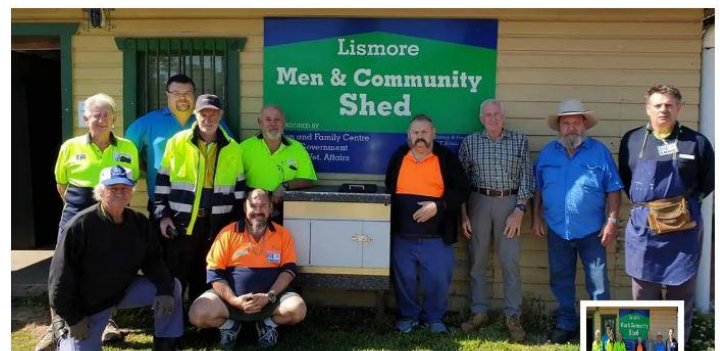
LISMORE MEN & COMMUNITY SHED

This has meant that the Lismore Men’s Shed is now able to not only assist folk in Lismore who too were flooded out of house and home but also other Men’s Sheds in their area who are keen to restock and revitalise their flood ruined workshops.