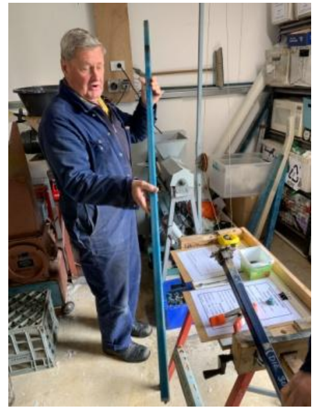
9. The still-warm stake is extracted.