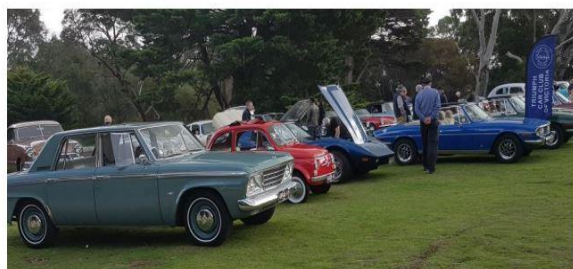
AOMC News July 2022 16

How often have we heard that old saying, usually from those more mature than us!!