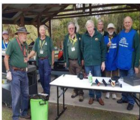
The Dingley Mens Shed Crew