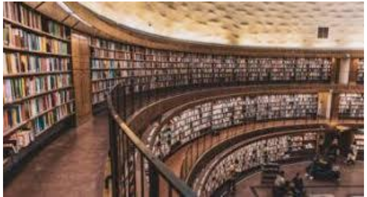
Artists impression of the planned library extension for the book corner of the shed. There may be a slight problem with the height requirement but lifting the roof should solve that - watch out for future updates.