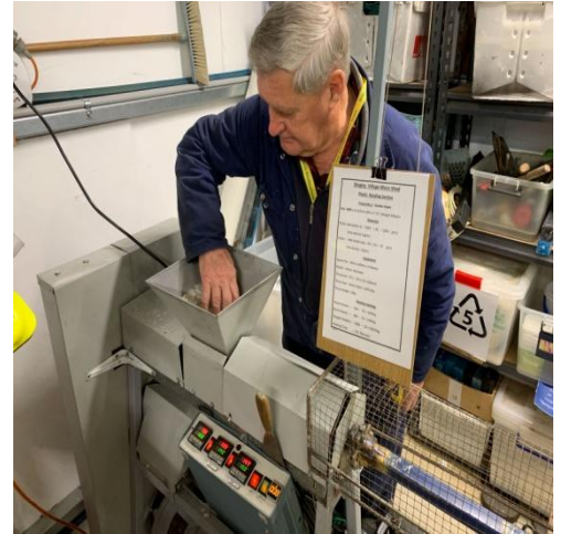
3. The ground bottles are placed in a hopper and melted.