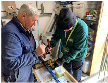
8. The end of the mould is removed.

( Not very scientific but sometimes the simplest method does the job just fine.)