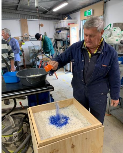
2- Colour is added using ground bottle caps.