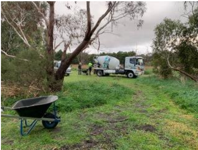
Having to barrow the concrete from the truck to site.

We have some more mesh to bring around, a wheel bin and a butterfly valve that is lying in the grass.