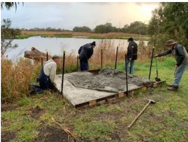
Levelling the mesh.