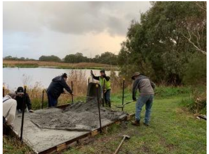
Gradually filling the boxing.