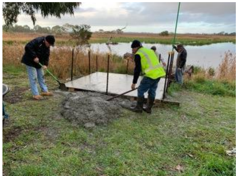
All smooth and the slump in front to fill the entrance.